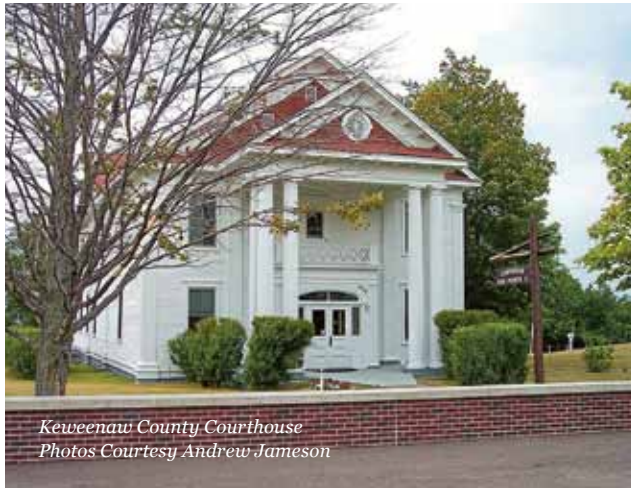
Keweenaw County Courthouse