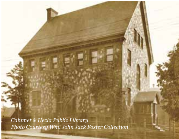
Calumet & Hecla Public Library