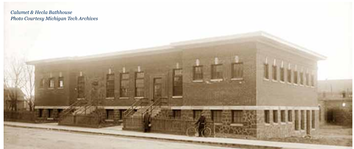
Calumet & Hecla Bathhouse