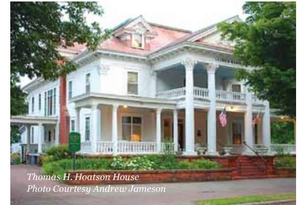
Thomas H. Hoatson House