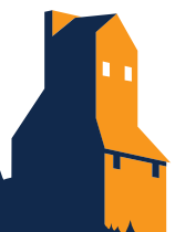
St. Anne's Church

CONTINUE EXPLORING AT coppercountrytrail.org